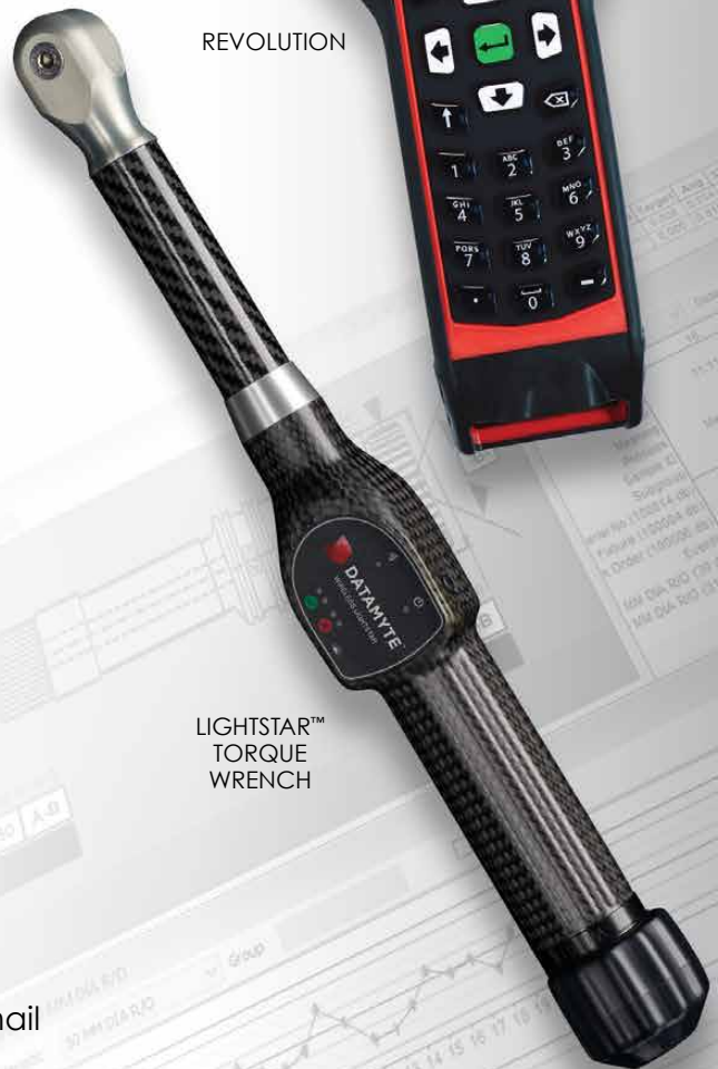
LIGHTSTAR™ TORQUE WRENCH